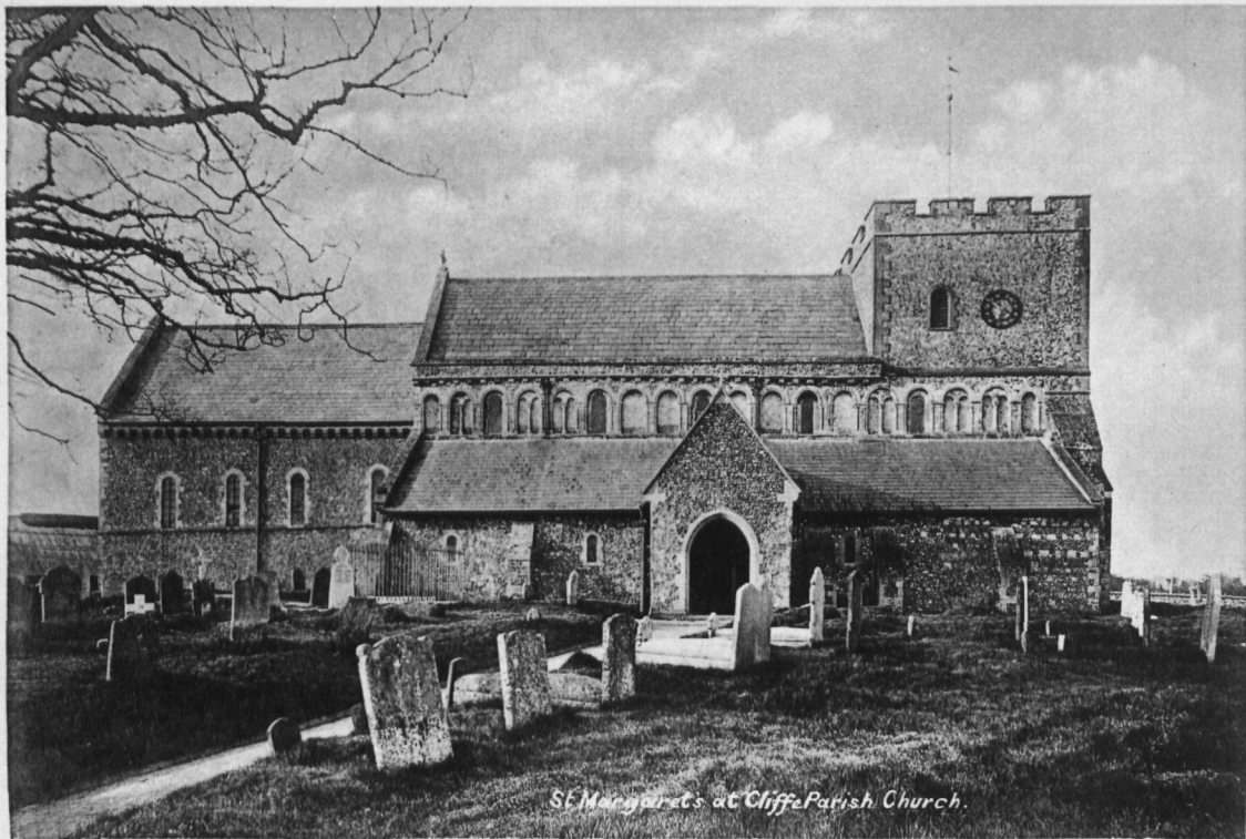
St. Margaret's at Cliffe Parish Church.